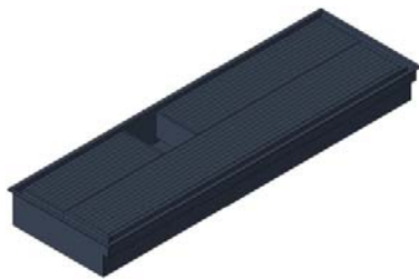
Family Type PLSK 06 06/00