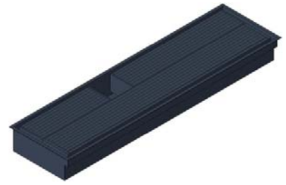
Family Type PLSK 05 05/00