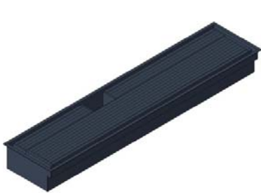
Family Type PLSK 03 05/00