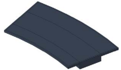
Family Type PL07 10 5/5