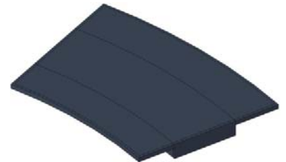
Family Type PL07 13 7/6